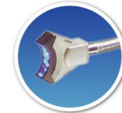
Seven LEDs have passed special process.