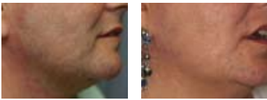
Fig. 1 Permanent hair reduction using the 650 handpiece

BEFORE AFTER 4 TREATMENTS