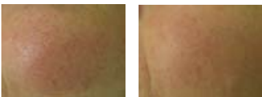
Fig. 2 Thread vein treatment using the 585 handpiece

BEFORE AFTER 4 TREATMENTS