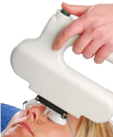
Fig. 3 Treatment of superficial vascular lesions around the nose